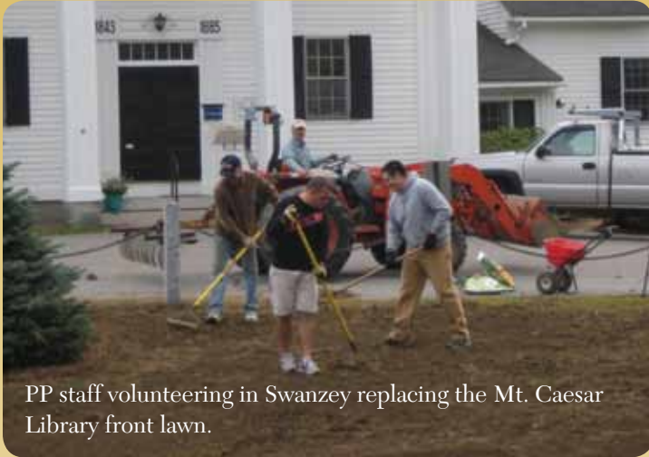
PP staff volunteering in Swanzy replacing the Mt. Caesar Library front lawn.